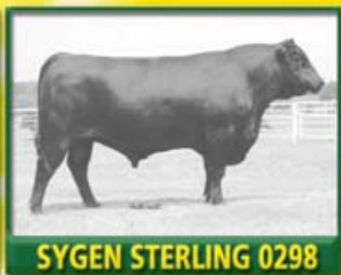
After ratioing 250 for IMF at Graupman's, we re-purchased him for $3,500 and re-sold him again through our 2002 sale for $22,000 to Express Genetics. Sterling currently records the 6th highest IMF EPD among active Angus sires, and with his first four progeny scanned at an average IMF ratio of 123, the possibilities are endless . . .