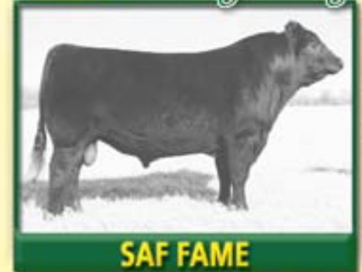
1993 Sale - $27,000 to Van Nice Angus Ranch, Silver Star, MT Generated over $1.8 million in semen sales to date.