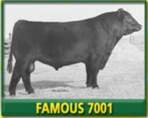
1996 Sale - $4,000 to A&M Circle T Farms, as an unborn calf in his dam, TK Karen 1369. Named Grand Champion Bull of the 2000, National Western Stock Show, he has sired several very popular show ring winners, including the unprecedented Grand and Reserve Grand Champion Bulls at the 2003 National