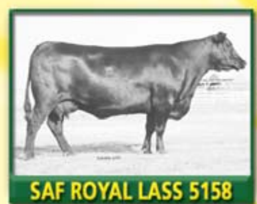
1996 Sale - $6,000 to Grandview Plantation, Como, MS. Topped the 2001 Grandview/Womack Sale at $48,000 to Kahn Cattle Co. Sold in the 2003 Kahn dispersion for $100,000 to Southern Cattle Co. Her flush sister sold in our 1995 sale for $4,000 to Fretwell Angus, and topped his 2000 consolidation dispersion at $26,500 to NER Farms.