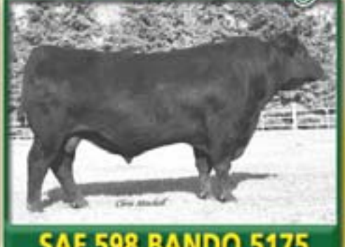
1995 Sale - $2,800 to Elm View Angus, Bath, SD Re-sold in their 1998 dispersion for $6,000 to Schaff's Angus Valley Generated well over $1 million in semen sales at Genex