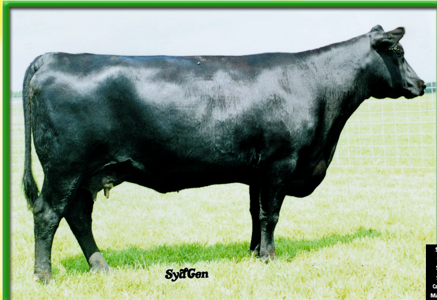
SAF ROYAL QUEEN 5084