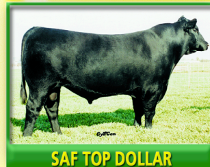
SAF TOP DOLLAR