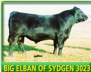
BIG ELBAN OF SYDGEN 3023

Acclaimed as the curve-bender dam of the Angus breed, SAF Royal Queen 5084 spreads the numbers, adds scrotal and fertility, and creates "the look." As she enters her twilight years, our 2005 sale offering will carry more of her influence than ever before. Direct progeny will sell by SydGen Sterling 0298, Summitcrest High Prime 0H29, BCC Bushwacker 41-93, and KCF Bennett Coalition SCC. The first progeny of her sons SydGen Eclipse 2478, SydGen Bouncer 2458, Big Elban of SydGen 3023, and Big Elban of SydGen 3067 will be highlighted, as well as the progeny of her proven, high-accuracy sons.