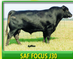
SAF FOCUS J30