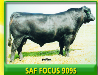
SAF FOCUS 9095