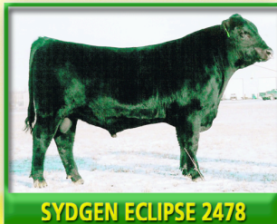
SYDGEN ECLIPSE 2478

Acclaimed as the curve-bender dam of the Angus breed, SAF Royal Queen 5084 spreads the numbers, adds scrotal and fertility, and creates "the look." As she enters her twilight years, our 2005 sale offering will carry more of her influence than ever before. Direct progeny will sell by SydGen Sterling 0298, Summitcrest High Prime 0H29, BCC Bushwacker 41-93, and KCF Bennett Coalition SCC. The first progeny of her sons SydGen Eclipse 2478, SydGen Bouncer 2458, Big Elban of SydGen 3023, and Big Elban of SydGen 3067 will be highlighted, as well as the progeny of her proven, high-accuracy sons.