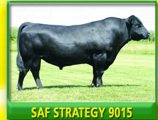
SAF STRATEGY 9015