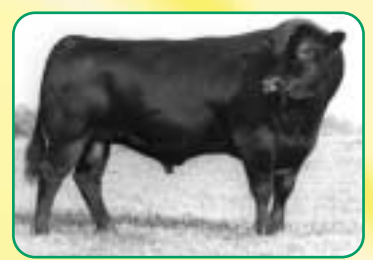
VDAR NEW TREND 315

This spring's Midland Bull Test Sale results lend itself to such a story. Beaver Ridge Farm, Bob & Cathy Watkins, purchased SAF Royal Lass 7036 in our 1997 sale for $4,750. She was selected for the strength of her carcass numbers (SVF HI ROAD/VDAR NEW TREND 315/SCOTCH CAP), the herd sire