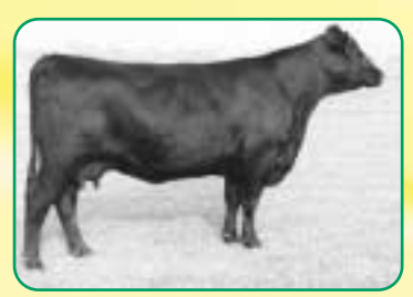
SAF ROYAL LASS 1002