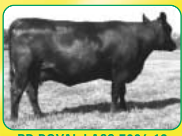
BR ROYAL LASS 7036-19