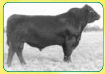
SVF HI ROAD

Join us on November <mark>23 as</mark> we unveil the newest generation o<mark>f Syde</mark>nstric<mark>ker Genetics, and celebrate our 50th Anniversary in</mark> the Angus business.