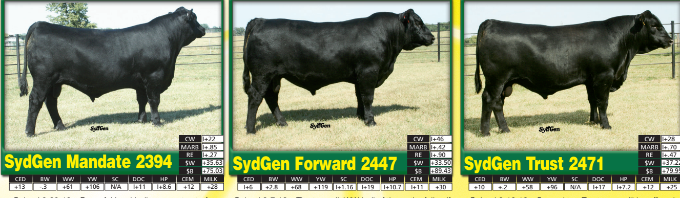
Calved 8-30-12 • Powerful herd bull prospect out of a Corona daughter descended from the 1027 cow that produced SAF Fame.