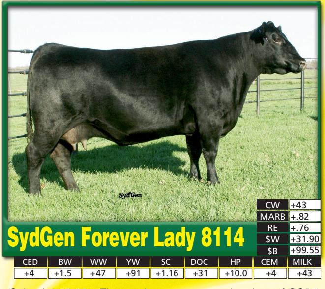
Calved 1-15-08 • The number one proven daughter of CC&7 on the $B index in the Angus breed will calve in October to SydGen Turbo 6684.