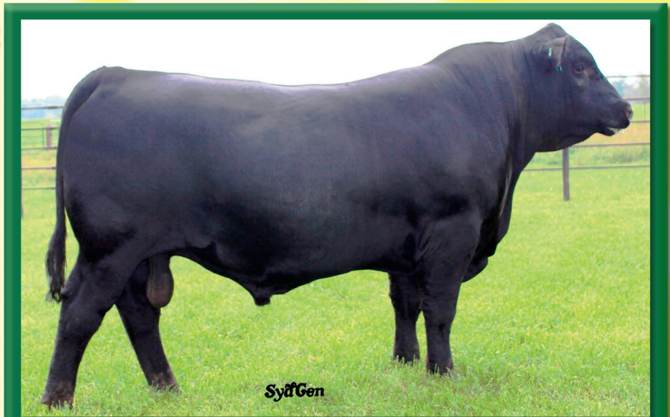
SydGen Express 5917 Reg. No. 18247356

One of the 100+ Fall Yearling Bulls to be offered is this September 7, 2015 son of SydGen Express. Co-owned with Silverado Farms in Iowa, he was purchased in our 2015 Sale as the natural calf alongside the $30,000 Trust donor, SydGen Envious Blackbird 102. Selling half interest and full possession.