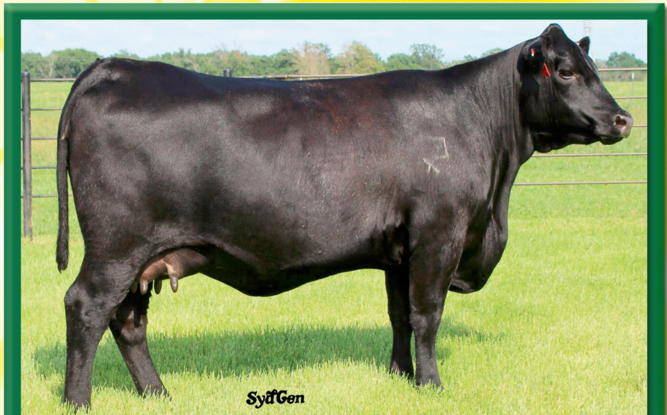
EXAR Rita 4887 Reg. No. 17870351

This Denver daughter is out of SJH 5050 of 6108 1061, an $80,000 feature in the recent Express Ranches Big Event. She calved two days after this photo was taken with our very first calf by EXAR Stud 4658B, making her heifer calf double-bred to the 6108 cow. We will offer half interest in this exceptional pair.