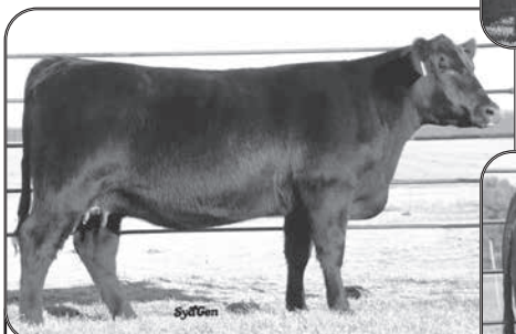
SYDGEN RITA 4860 Dam of Lots 56 and 78 Grandam of Lot 82