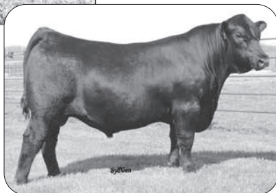
SydGen Eternity 0046 - Paternal brother to Lots 49-54 & Maternal brother to Lots 58-59.