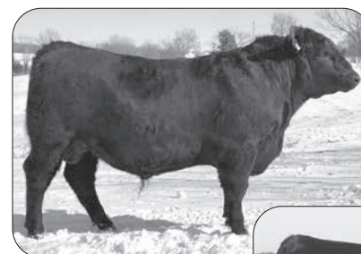
WAF Cool H04- Sells as Lot 29

Sydenstricker Genetics Complete EPD package with a CED suitable for heifers. 17 maternal siblings to the dam have averaged in excess of $15,000 through SydGen production sales.