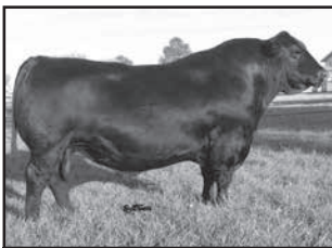
SydGen KCF Gavel 8361