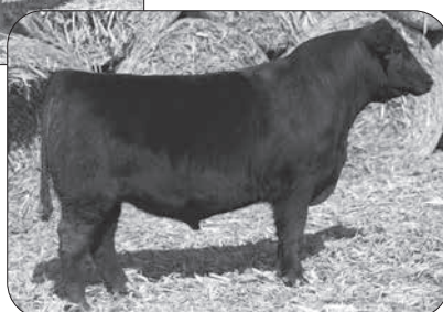
WB Gavel 1722- Sells as Lot 42