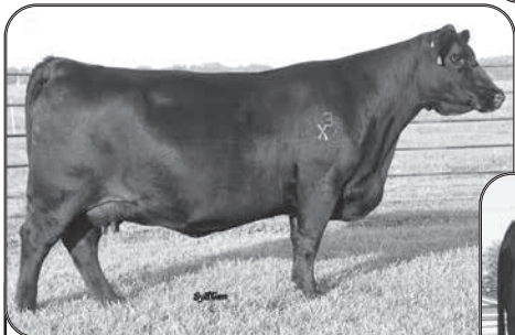
EXAR RITA 3405 Dam of Lots 40 and 41