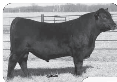
SydGen 9018 Northside 1387-Sells as Lot 65

Proven profit and performance bred into this Wake Up Call son that is out of a Northside dam that traces back to 8611, the dam of Black Pearl, Big Medicine, Patriarch, Jack Black, and Jeremiah.