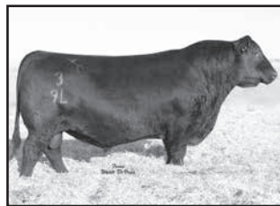
Connealy Cool 39L