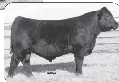
SydGen 9073 Blueprint 1303-Sells as Lot 70