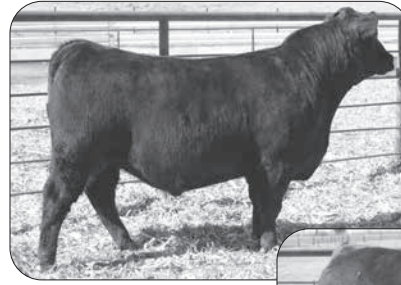
BCA True North 1004-Sells as lot 78