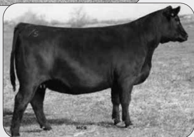
Dam of Lot 11

We now have six $ Indexes available on Angus cattle. $Weaning is a measure of the economic impact of four primary areas affecting animals from birth through weaning. Those four areas are birth weight, weaning weight, maternal milk, and mature cow size. It assumes an 80-20 mix of cows to heifers. $Feedlot is a measure of the value associated with post-weaning growth along with feed efficiency. $Grid is actually a measure of total end product value on a quality grid, using ultrasound and carcass data when both are available. $B is a combination of YW, CW, DMI, marbling, ribeye area and fat thickness into a terminal post-weaning value.