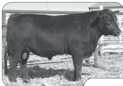
BCA Destination 1007-Sells as lot 56