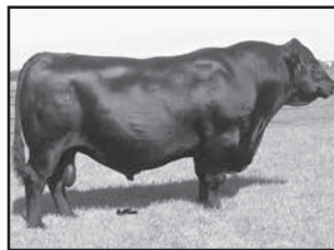
SydGen FATE 2800