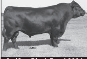
SydGen Black Pearl 2006