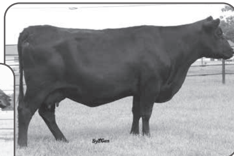
7L MARY BLACKBIRD 7177 Dam of Lots 79 and 84