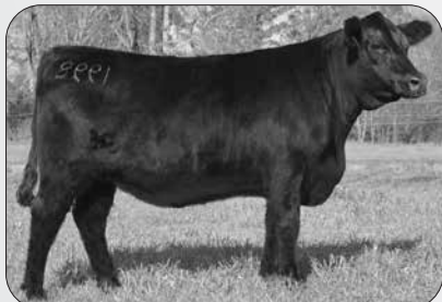
Dam of Lot 10