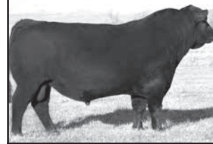
SydGen 928 Destination 5420