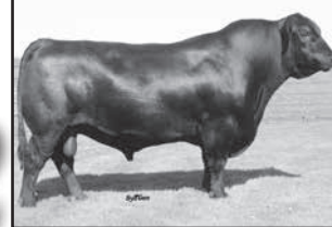
BCA Patriarch 4113