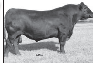
Bakers Northside 6007