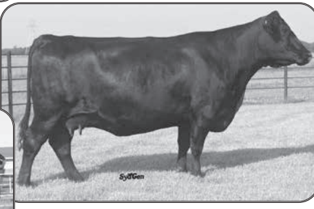
SYDGEN EVERGREEN 5005 Dam of Eternity and Lots 58-59