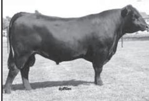
SydGen BAR Landslide 5246