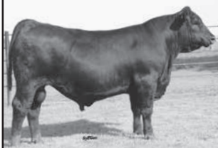
SydGen Wake Up Call 5519