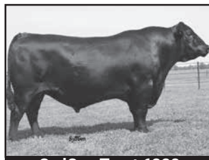
SydGen Trust 6228