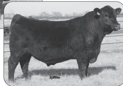
SydGen Merit 1068-Sells as Lot 26