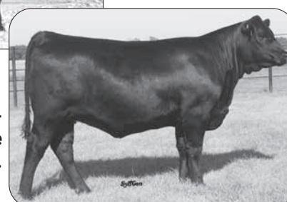
SydGen Fanny 7426 - $85,000 full sister to the dam of Lot 34.