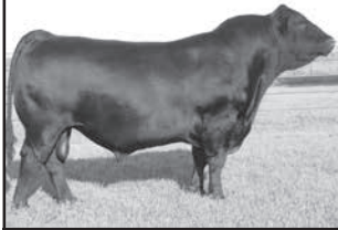
SydGen Big Branch 6653