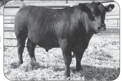
BCA Forward 1009-Sells as Lot 79