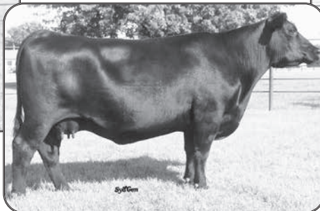
SYDGEN ENTENSE 3043 Grandam of Lot 75