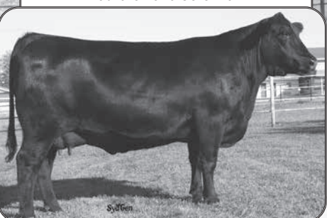
SYDGEN ANITA 8611 Dam of Black Pearl, Jack Black, Patriarch and Jeremiah