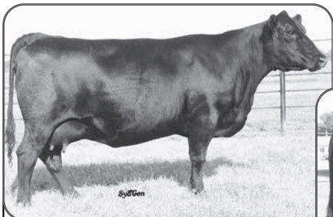
SYDGEN ROYAL LASS 1454 Dam of SydGen Slash 7405 Dam of Lot 46