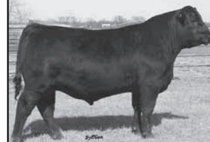
SydGen Advance GA 7301