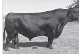
SydGen Exceed 3223