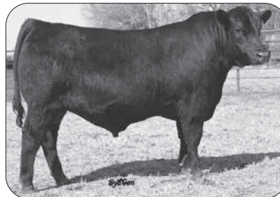
SydGen Bang GA 0346 - Service sire to Lots 90 & 92.

All three have February bull calves at-side, sired by HF Equity 0050 #19856871, BCA Exceed 8136 #19346837 and Deer Valley Growth Fund #18827828.