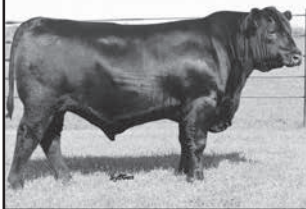
SydGen Merit 6553