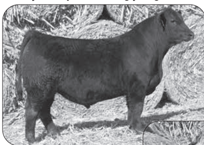
WB Rita's Gavel 1343 - Sells as Lot 41

Twin with lot 43. A great opportunity to purchase full brothers to increase calf crop consistency. Better yet when they are sired by one of the breed's very best up-and-coming young sires.