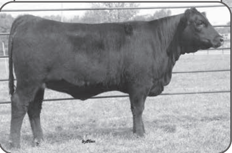
SYDGEN FOREVER LADY 4628 Dam of Lots 77 and 80