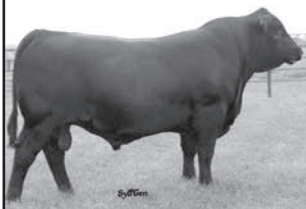
SydGen Expansion 5917