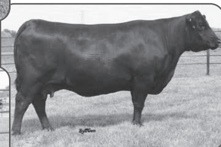
SYDGEN ENVIOUS BLACKBIRD 102 Grandam of Sydgen Advance